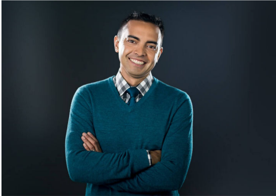
Pat Flynn -- Entrepreneur, Speaker, & Host of Smart Passive Income Podcast with over 60+ million downloads.